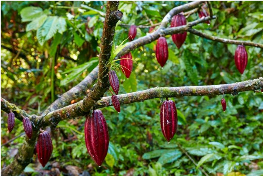
Young cocoa pods