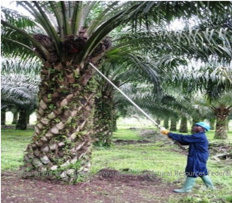
Oil Palm Plantation