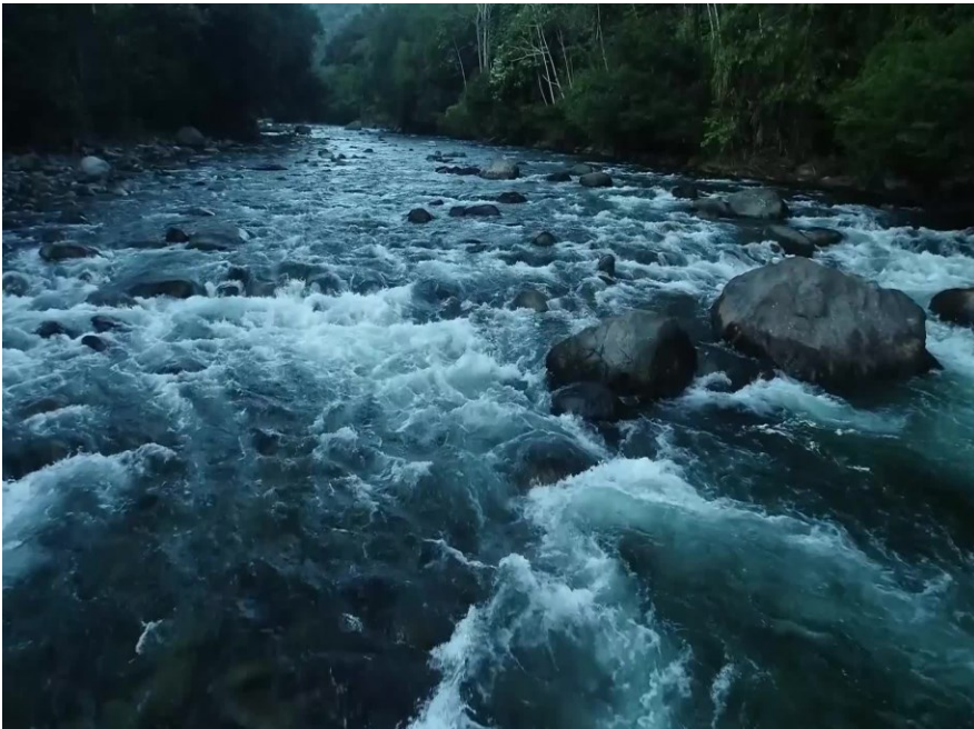
A River Rapid

Department of Economy, Investments and Natural Resources Federal Republic of Southern Cameroons-Ambazonia