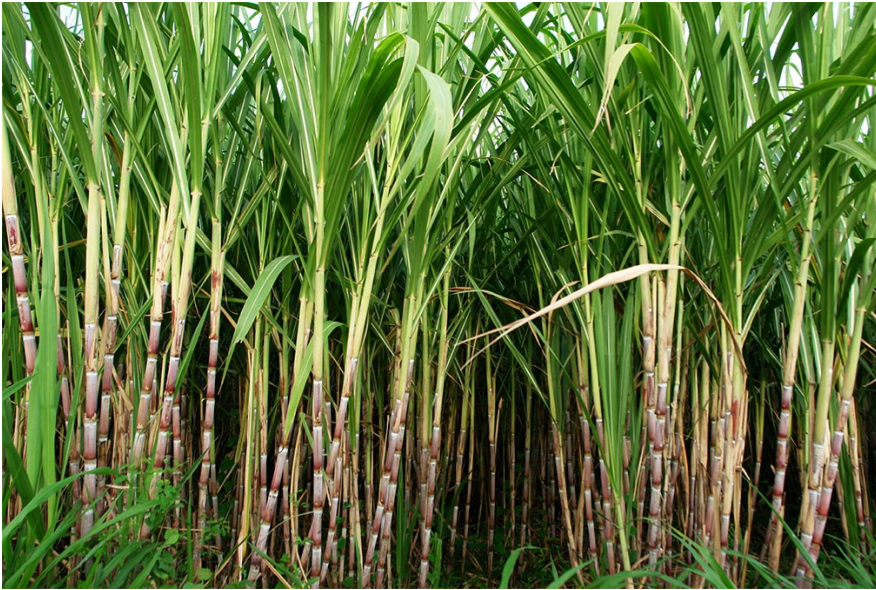
Hard skin sugar cane